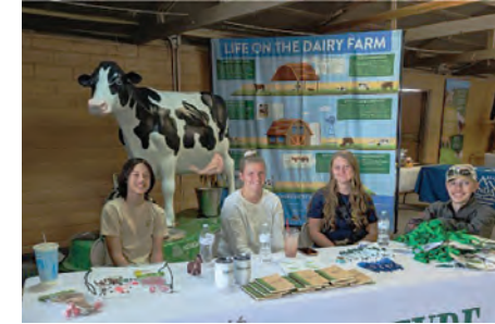
Ag Experience Entrance.