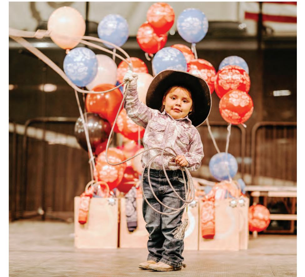
2024 Littlest Cowboy.