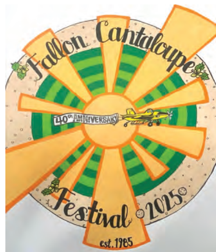
Artwork by Vanessa Burch-Urquhart — "Field and Plane" scene.

Fallon showed up and showed off for the 40th Anniversary Festival shirt design contest. With over 30 entries submitted, the response was nothing short of inspiring, revealing just how much artistic talent lives right here in our own backyard.